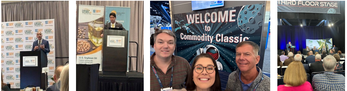
Pictures from a busy week in Texas at the USSEC board meeting and Commodity Classic.