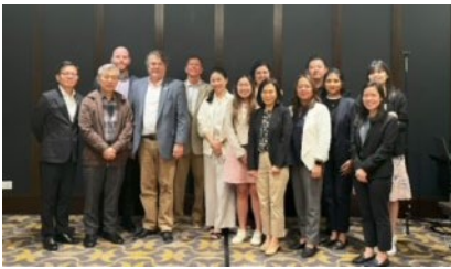
Pictures from USSEC Meeting (above) and the Presidential Palace (below) in Vietnam