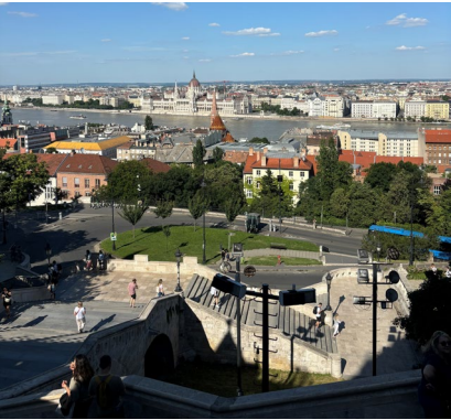
An aerial view of the city of Budapest