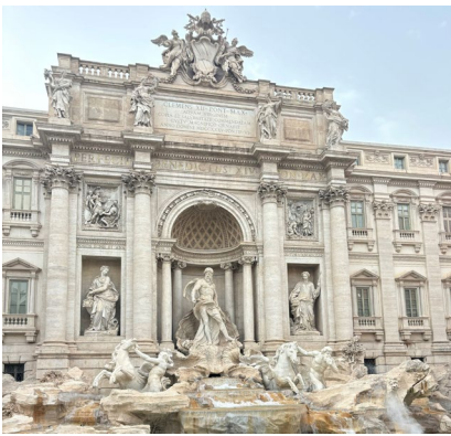
Trevi Fountain in Rome, Italy